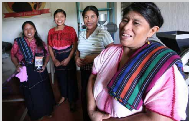
Members of the women-only group that produce "Café Femenino" at the Nahualá cooperative.

As a result of Nahualá's participation in Café Femenino, more women have joined the cooperative. Importantly, in a sector in which men typically collect payment, the women of Nahualá, in accordance with Café Femenino rules, are paid directly, which gives them enhanced visibility of cash flows. Nahualá's women members attend cooperative trainings as often as their male counterparts, although they are still less likely to participate in the cooperative's assembly meetings, indicating that they continue to be underrepresented in decision making at the organizational level. While women still perform "women's tasks" on the farm, such as harvesting and sorting, they are increasingly involved in the steps of coffee production traditionally restricted to men, such as pruning and fertilizer application.