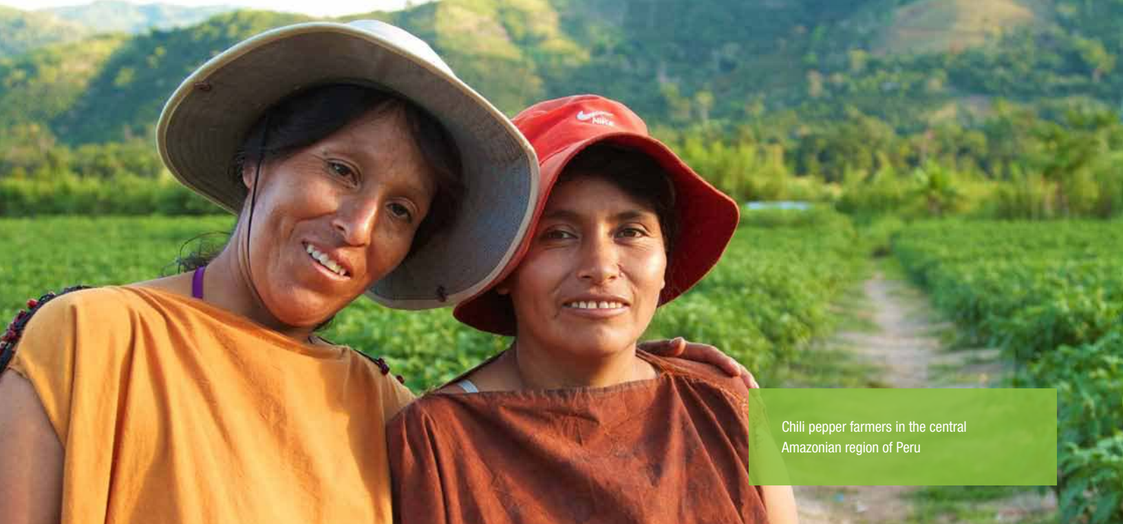
Chili pepper farmers in the central Amazonian region of Peru